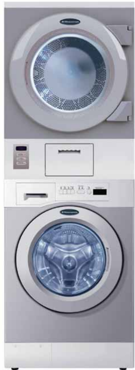
NON-METERED STACKING WASHER AND DRYER—(GAS HEAT DRYER) Model No. WDSGMM