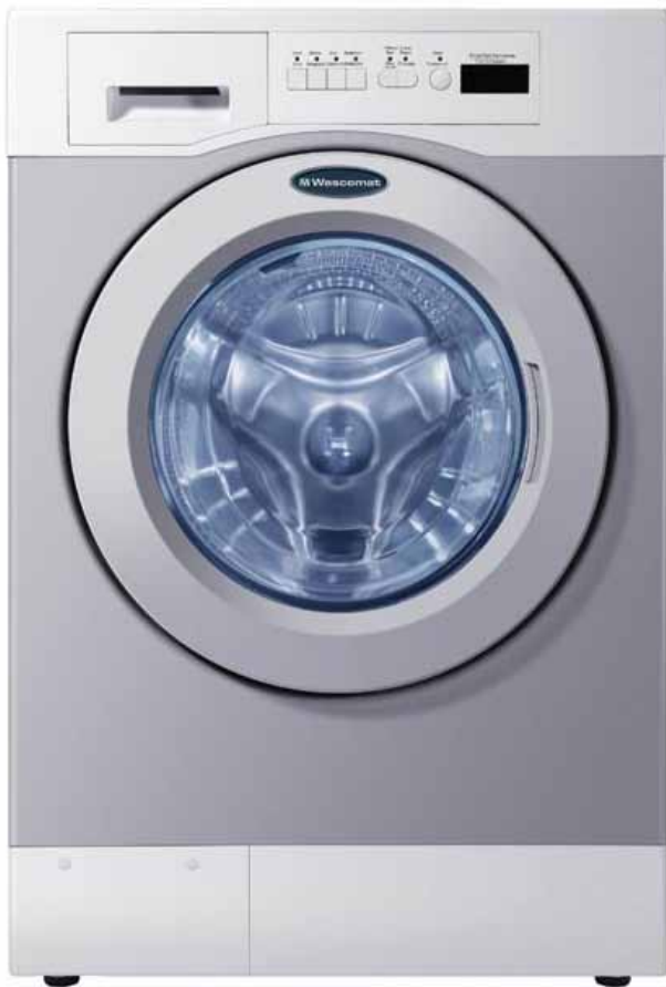
CROSSOVER OPL WASHER Model No. WHWF09810NM