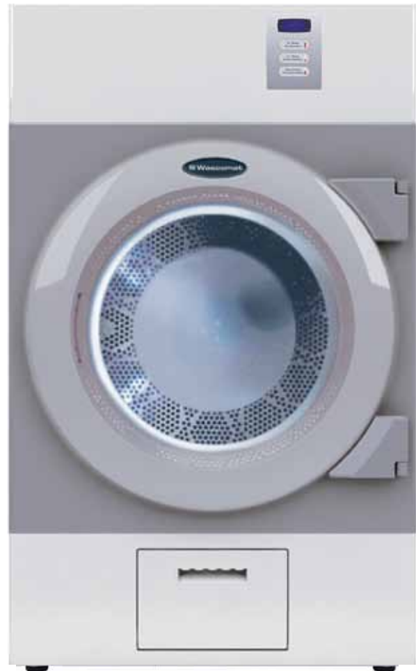
CROSSOVER DRYER—GAS Model No. DAWF0GNM